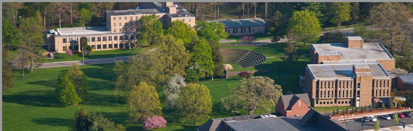
College of Saint Elizabeth Campus