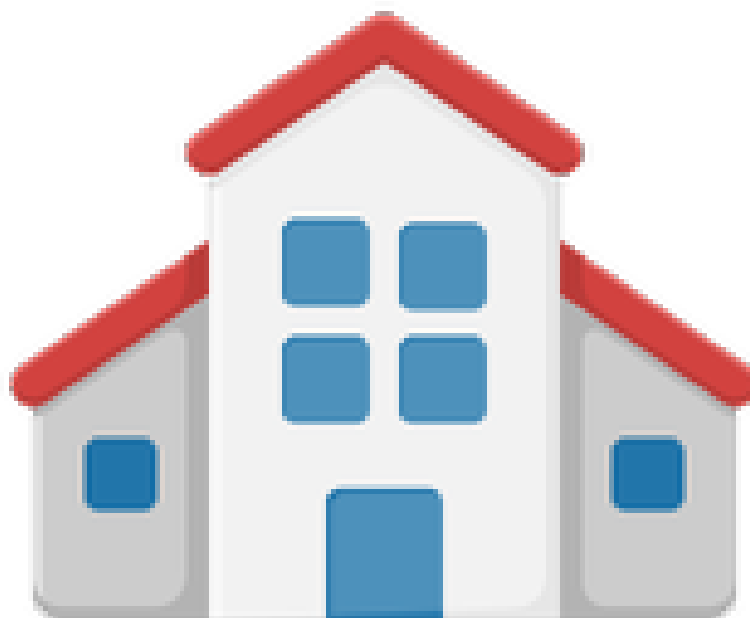
Place of Public Accommodation

(/dcr-complaint-intake-home/new-jersey-family-leave-act/)