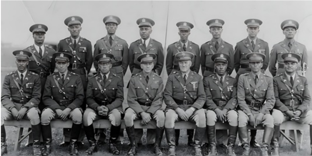
Officers of the 1st Separate Battalion, New Jersey State Militia in 1935.