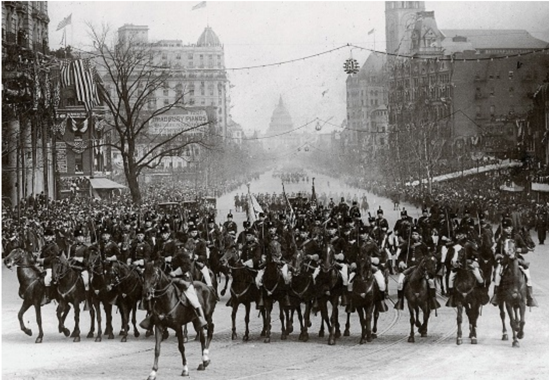
Essex Troop in Washington, D.C. in 1913