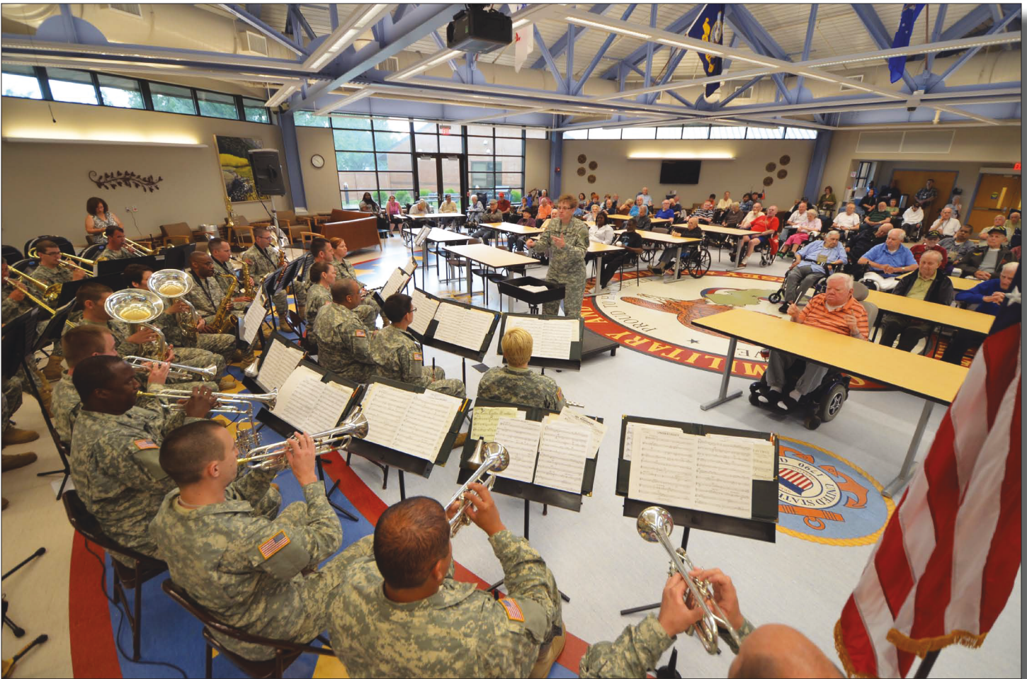
The 63rd Army Band, New Jersey Army National Guard, entertains residents at the New Jersey Veterans Memorial Home at Paramus, July 1,