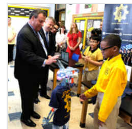
Bergen Arts & Science Charter School Wednesday, May 18, 2016