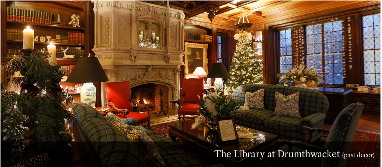
The Library at Drumthwacket (past decor)