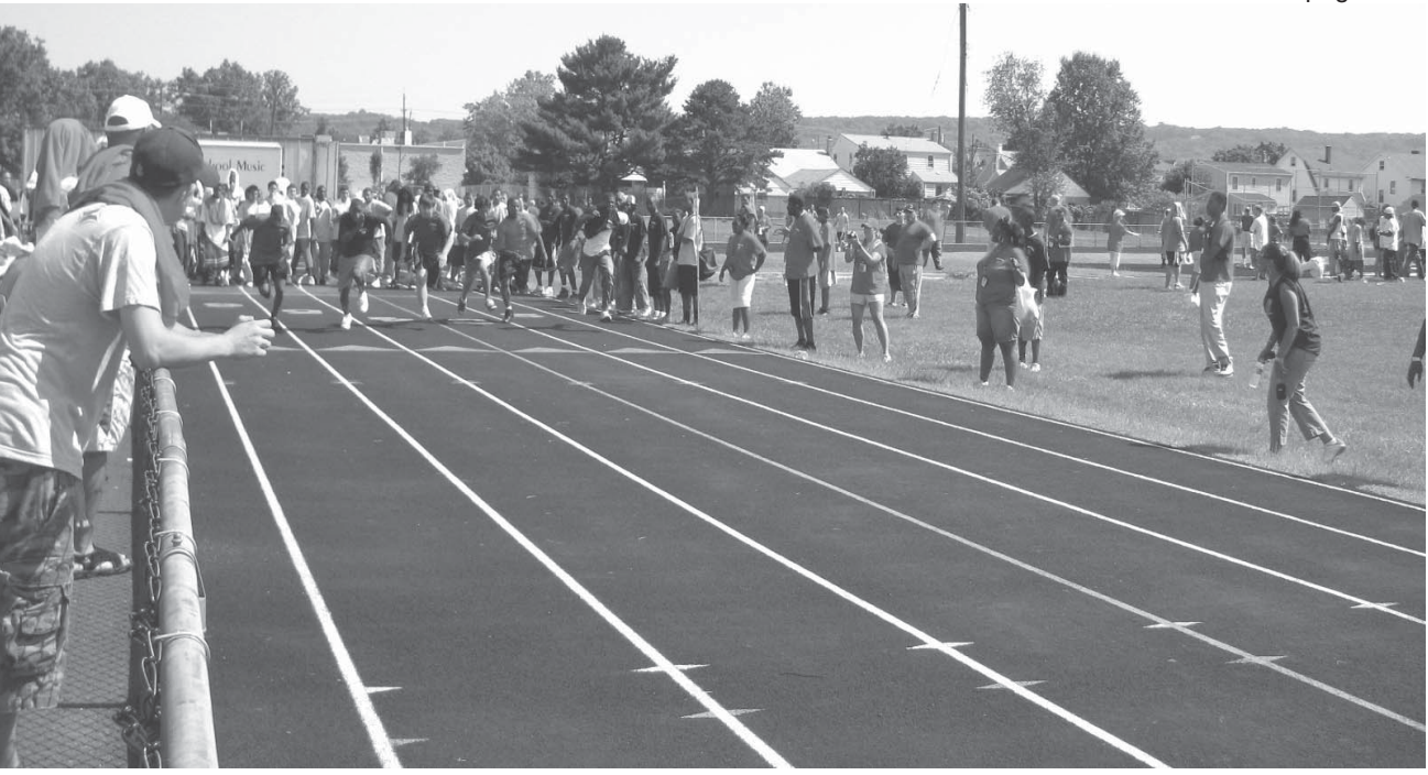
They're off! Probation youth prepare to race at the 20th Annual Judiciary Olympics. (See article and more photos on pages 8 and 9).