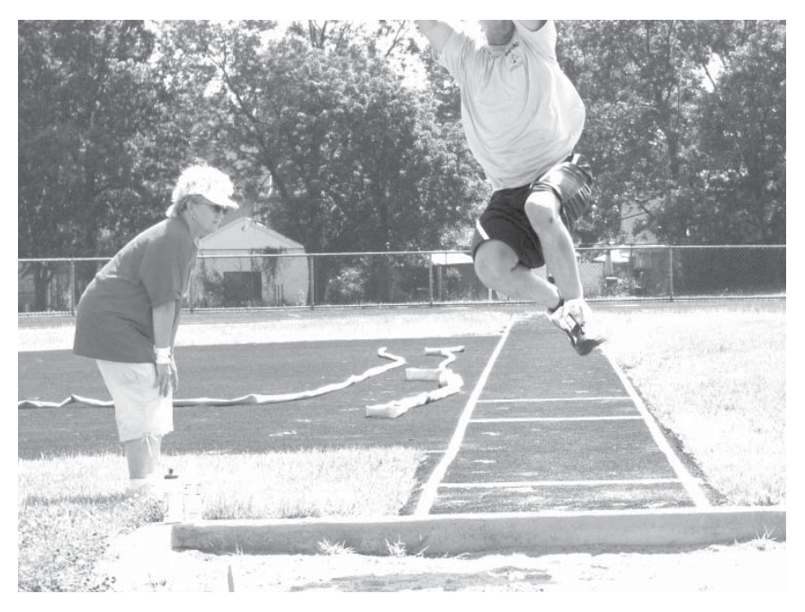
Vigorous activity--Competitions included volleyball, tug of war and long jump. Top left, a probation client receives an award for excellence..