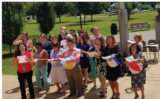
As part of the Monmouth Vicinage Summer Series, civil division staff perform an original version of "The Mighty Quinn" at the Monmouth's Got Talent program.