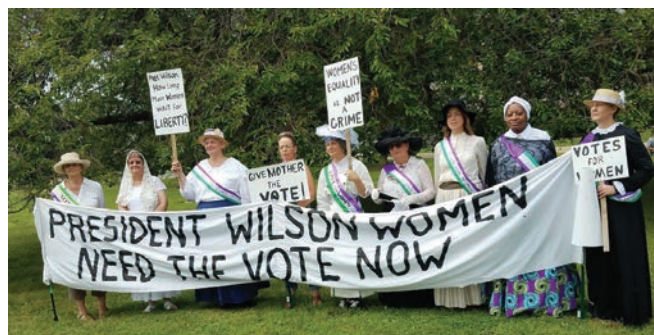
At a Women's Equality Day program, key figures in the suffrage movement were portrayed by vicinage employees and volunteers from the Ocean Grove Historical Society, the Monmouth County Historical Association and the Monmouth County Society for World Religions and Ethical Thought.

These activities enhanced the vicinage's positive energy, strengthened connections between judges and employees across divisions and reinforced the relationship between the court and community. The vicinage plans to continue these programs through the fall and winter while planning activities for next summer.