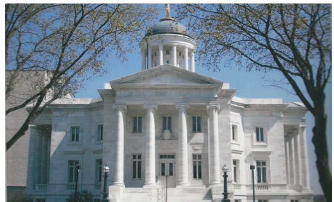
The Somerset County Courthouse as it appears today.