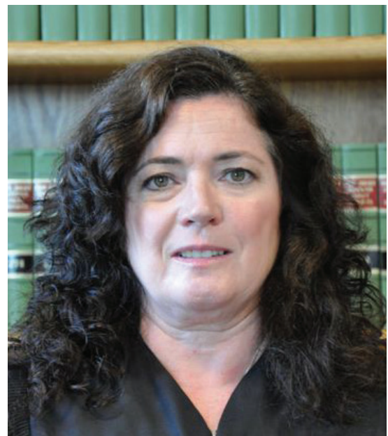
Judge Mary Brennan

Judge Lasser was instrumental in the formation of the New Jersey Tax Court and was its first presiding judge. He also was instrumental in establishing the National Conference of State Tax Judges in an effort to provide continuing legal education in this highly special area of law.