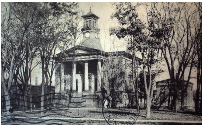
The Somerset County Courthouse in Somerville as it appeared in the early 20 th century.

Gordon designed a structure containing 46 offices and rooms. It featured a paneled rotunda extending from the ground floor to a leaded glass dome in the roof, surrounded by a marble lantern. There were five courtrooms opening into the galleries on different floors around the central rotunda. The white, Alabama marble-faced courthouse was targeted for demolition years later because it became too small for the growing county. Instead, county officials decided to restore the building and built a much larger, modern building next door in 1986.