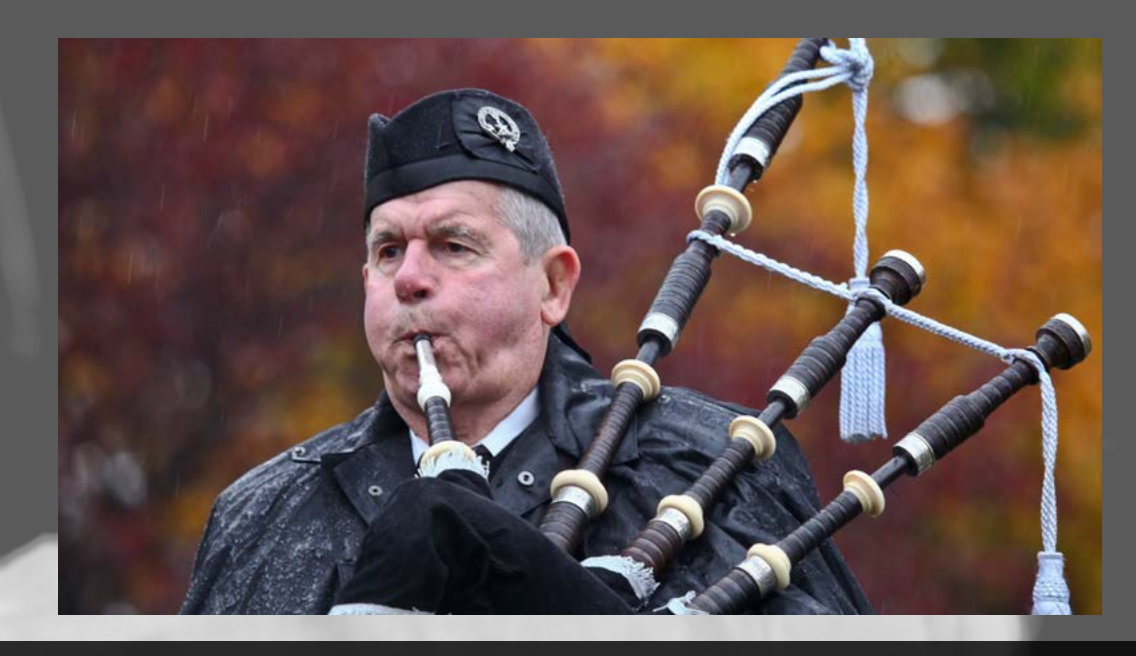
A bagpiper plays during a memorial ceremony and monument dedication for 15 Passaic, N.J., soldiers who lost their lives in a crash on Imperial Airlines Flight 201/8 on Nov. 9, 1961. The ceremony took place on the 55th anniversary of the crash, in Passaic, N.J., Nov. 9, 2016.

A member of the New Jersey Army National Guard's Funeral Honor Team rings a bell in rememberance of the 15 Passaic, N.J. soldiers who lost their lives in a crash on Imperial Airlines Flight 201/8 on Nov. 9, 1961.