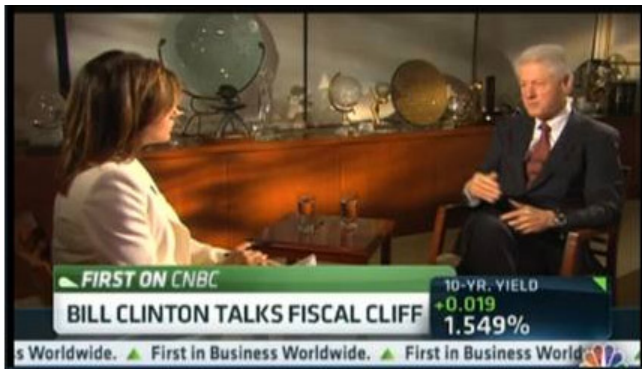
President Clinton: Give Up Tax Hikes

Former President Bill Clinton Agrees: Assembly Democrats Giving Up On Raising Taxes "Probably The Best Thing To Do Right Now" To "Avoid The Fiscal Cliff"