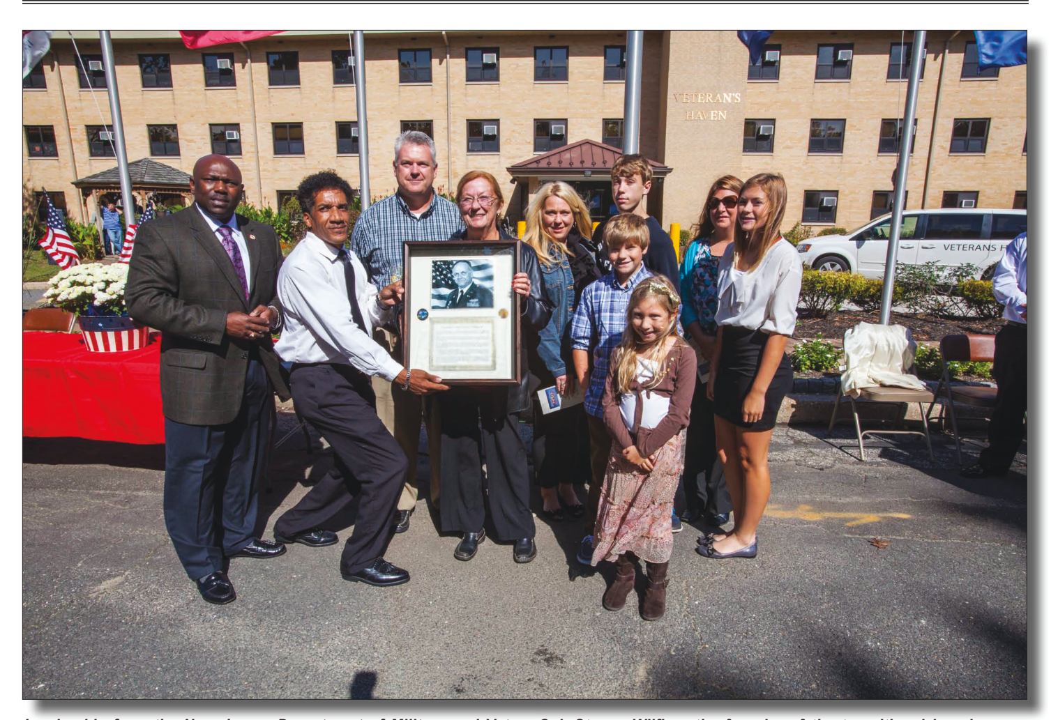
Leadership from the New Jersey Department of Military and Veterans Affairs held a donor appreciation and flag replacement ceremony at the Veterans Transitional Housing Program (Veterans Haven) in Winslow Twp., N.J., Oct. 13, 2013. During the ceremony, facility and NJDMAVA members rededicated a plaque honoring Lt.