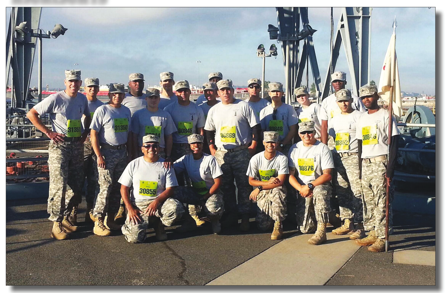
Several Soldiers from Foxtrot Co., 250th Brigade Support Battalion, participate on the 12th Annual Tunnel to Towers 5K Run and Walk Sept. 29,