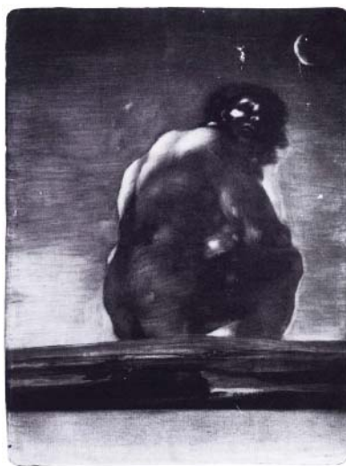
The Giant by Francisco Goya, 1818

The painter was Goya. Scholars believe he painted the work sometime after 1792—the year Goya became totally, profoundly deaf and also the year the child died. Suddenly my problems didn't seem so important. I was just very thankful that Goya's hard work and perseverance left such a legacy of pleasure.