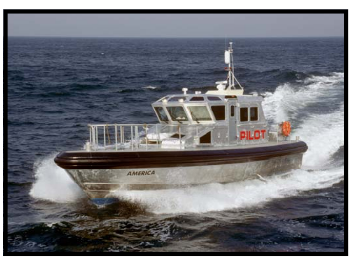
The Pilot Boat America

The P/B New Jersey and P/B New York are the assigned Port of New Jersey/New York station vessels. They stand watch at the ocean entrance to the harbor in the vicinity of the Ambrose Light Tower at the terminus of the New York Traffic Separation Zone. They operate twenty-four hours per day, three hundred and sixty five days a year, in all weather conditions. State Apprentice Pilots serve as the Master and bridge watch officers of the pilot boats as a part of their training and education curriculum.