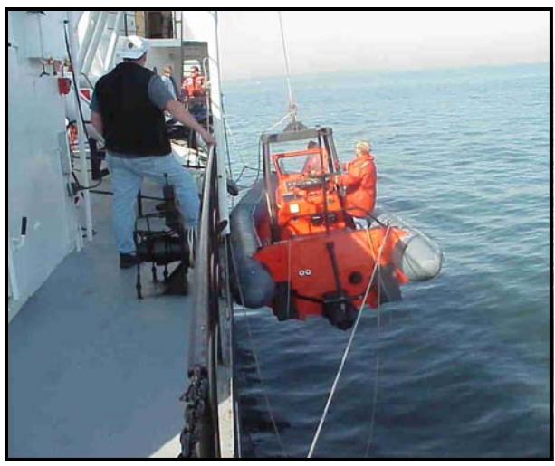
Once a vessel is safely guided out of the port a RIB is often used to lower the Maritime Pilot to the awaiting pilot boat.