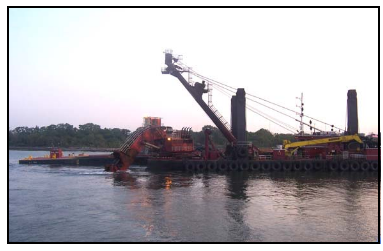
The Dredge New York, owned and operated by Great Lakes Dredge and Docking Company works on the Arthur Kill deepening project.

ing the stability of the PVSC outfall tunnel situated below the project area. Over the past year, the State of New Jersey and the project management team have been surveying and monitoring the conditions in and around the tunnel in order to design a way to dredge the channel without jeopardizing its integrity. This work is expected to result in a final design by April of 2007. In the meantime, a contract will be let soon to dredge the channel area outside of the footprint of the outfall tunnel. It is anticipated that work will begin in June of 2007 and run through the end of 2008.