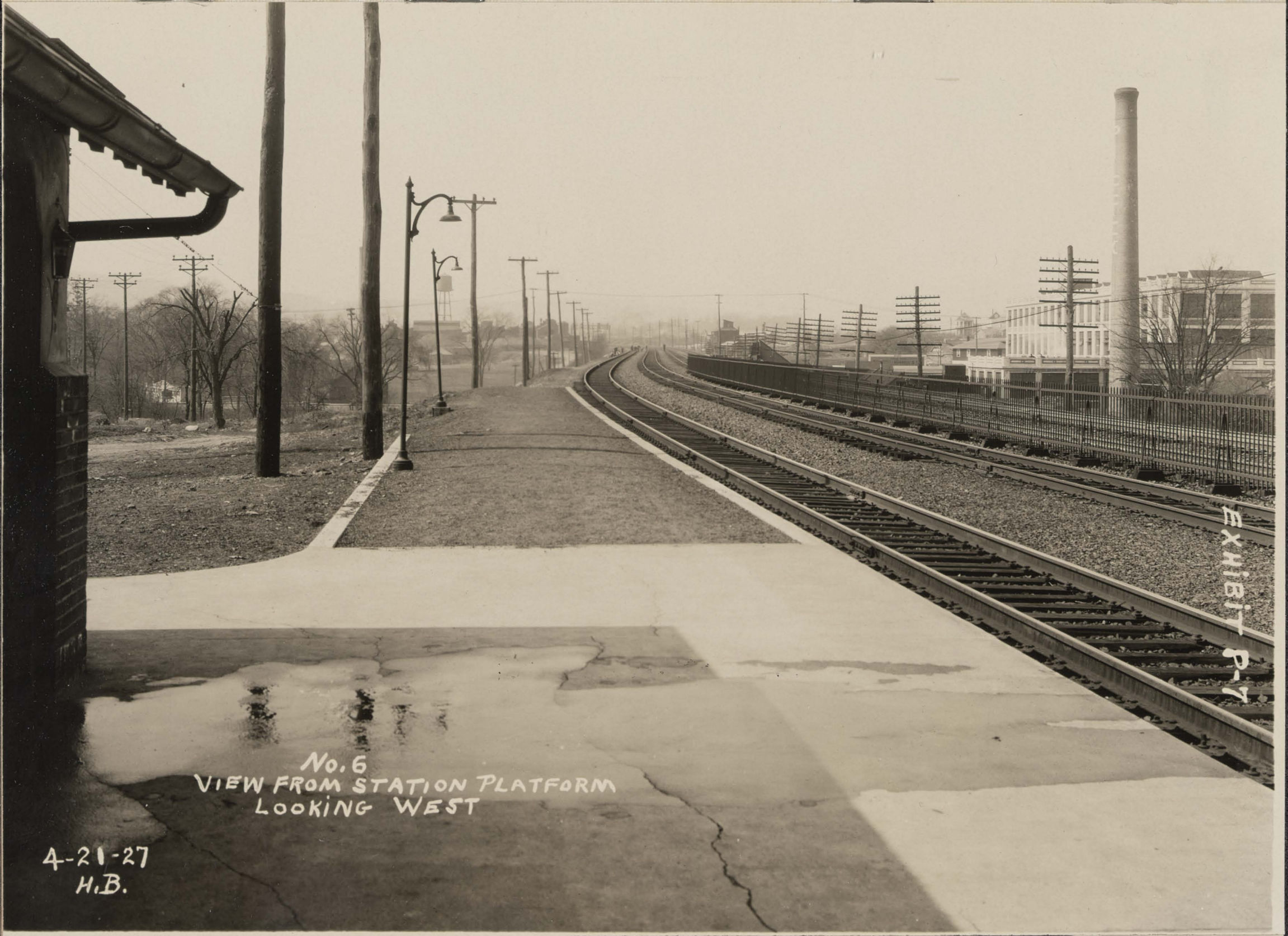
No. 6 VIEW FROM STATION PLATFORM LOOKING WEST