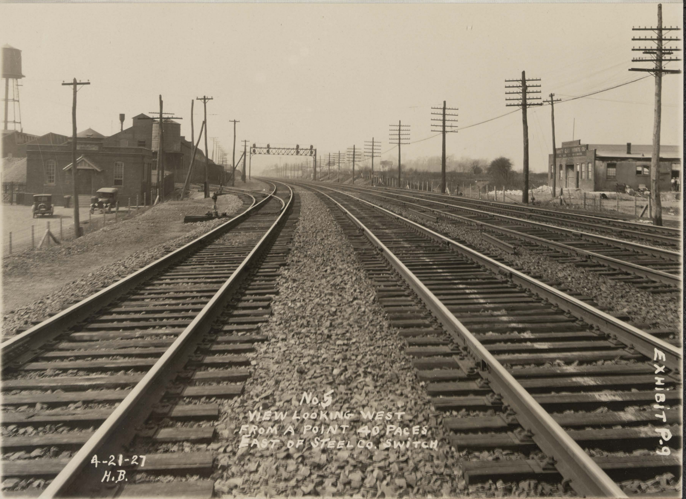
No. 5 VIEW LOOKING WEST FROM A POINT 40 PACES EAST OF STEEL CO. SWITCH