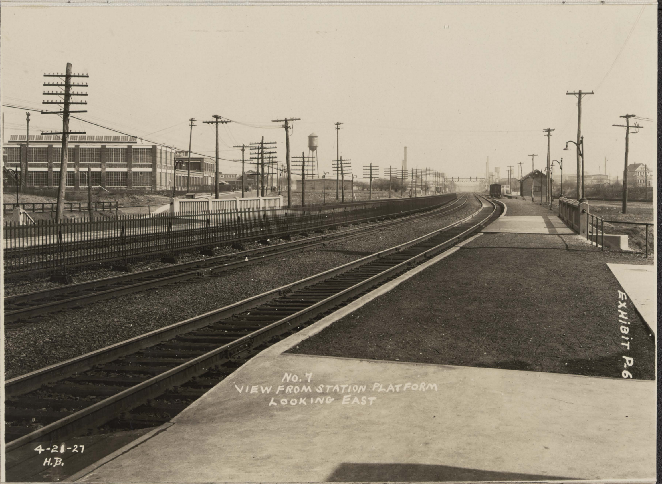
No. 7 VIEW FROM STATION PLATFORM LOOKING EAST