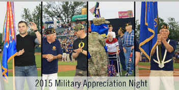
2015 Military Appreciation Night

FEATURING A SPECIAL PREGAME MILITARY AND VETERANS RECOGNITION!