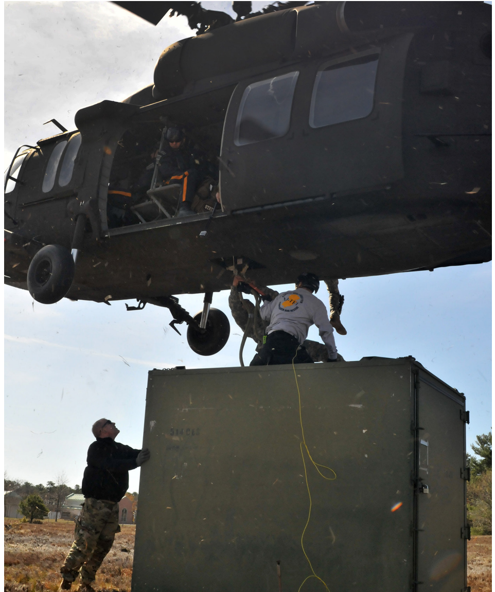
Members of 1-150th Assault Helicopter Battalion, Jersey Army Army National Guard, and the New Jersey State Police connect a sling loaded search and rescue gear container to a Black Hawk helicopter as part of a New Jersey Task Force 1 exercise.

"We try to be diligent as well as honest with our capabilities," he said. "We try to prove that we are who we say we are. We are never satisfied, because the next