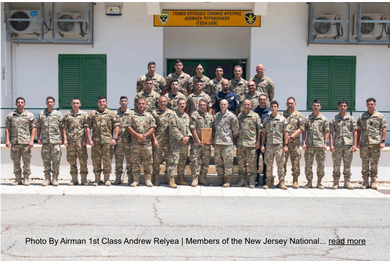
Members of the New Jersey National... read more