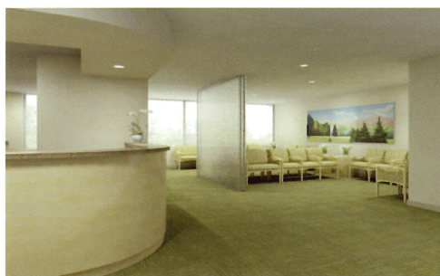
Rendering of Chilton's Comprehensive Breast Center

O n November 10, 2009, the Authority issued $39,195,000 on behalf of Chilton Memorial Hospital, a non-profit 256-bed facility servicing residents from more than 33 communities in Morris, Passaic, Sussex, Bergen and Essex counties.