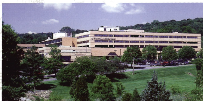
Hunterdon Medical Center