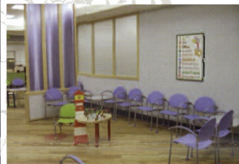
CHEMED's family-friendly interior

In August, the Authority announced a new loan program to ease the burden of start-up costs for Federally Qualified Healthcare Centers (FQHC). On January 29, 2010, the Center for Health Education, Medicine and Dentistry, known as CHEMED, became the first benefactor of that new program.