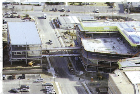
Top: Rendering of Shore Memorial's new pavilion; Middle and Bottom: Actual construction of the pavilion site

In 2009, Shore Memorial approached the Authority with an interest in financing $45 million to fund the construction and equipping of a new surgical pavilion. Earlier that year, the American Recovery and Reinvestment Act created new parameters for bank qualified bonds (tax-exempt bonds for which a financial institution, in this case TD Bank, can deduct the carrying costs associated with the bonds). This, in turn, can help the hospital negotiate a more favorable interest rate.