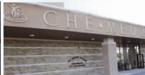
Lakewood's CHEMED - the first borrower through the Authority's new FQHC loan program