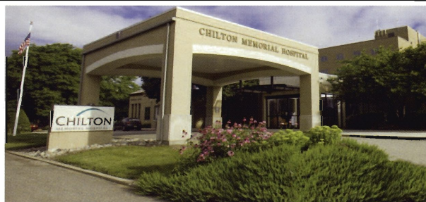
Chilton Memorial Hospital

The issue was structured as a fixed rate financing with serial bonds ranging from 2012 through 2020 and three term bonds in 2024, 2029 and 2039. The bonds were sold on the basis of Chilton's credit rating of "Baa1" by Moody's and "BBB+" by