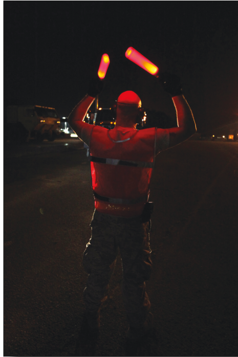
An air transport Airman directs traffic during night operations at exercise Eagle Flag, Aug. 15. While the 108th Contingency Response Group provided base support, Soldiers from the 689th Rapid Port Opening Element drove cargo to forward nodes.