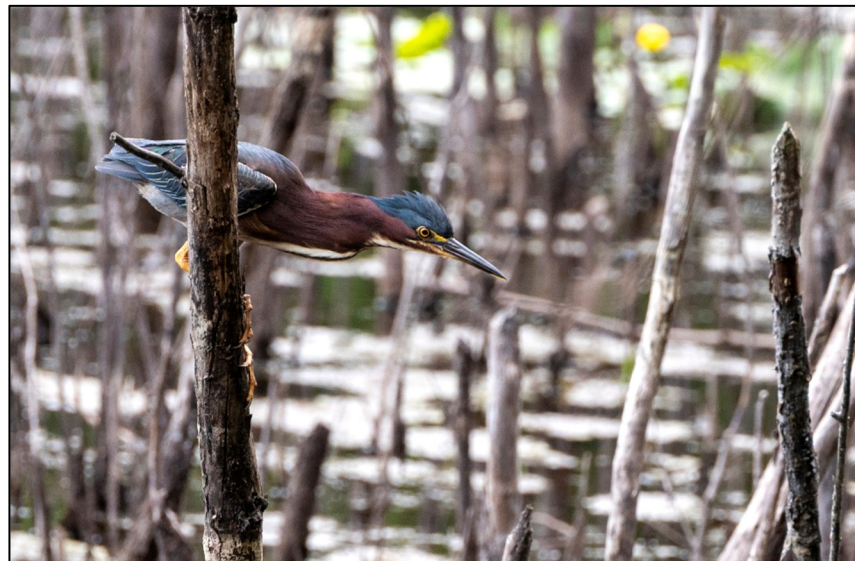
Above: The Commission shared 87 tweets on X in August, including this photo of a green heron foraging in a former cranberry bog in the Pinelands.