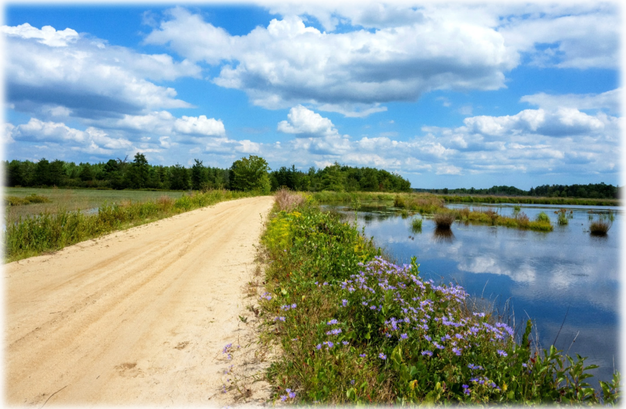
Cottony clouds hanging above water-filled bogs along a sand driving trail flanked by blooming asters and goldenrods at Whitesbog Village in the Pinelands, as photographed in August