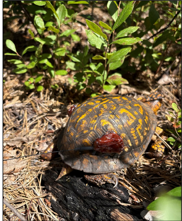
Above: A radio tracked turtle displays its new transmitter (right) and iButton (left). These devices will enable the science staff to collect habitat and temperature data from this individual for another year.

Staff scientists collected toenail clips from 27 box turtles for use in research being done by the University of Maine to combat illegal turtle trafficking. The variation in diet between wild and captive turtles results in different ratios of stable carbon and nitrogen isotopes in their body tissues. The University of Maine researchers are using this information to build a model to assist in the accurate identification of wild-caught compared to captive-bred individuals.