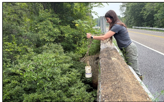
Left: A staff scientist uploads water level data from a continuously monitored pond, which was dry during the August visit. Right: Another scientist collects a water sample from a stream to assess pH and specific conductance.