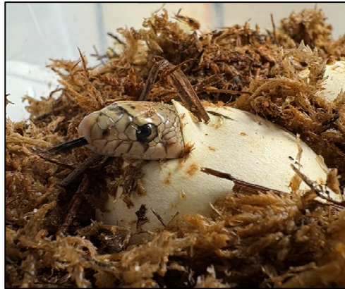
Left: A pine snake emerges from its egg after two months of incubation.

In August, staff used radio telemetry to track 17 corn snakes, 25 pine snakes, and one milk snake. A new corn snake and new northern black racer were also found and PIT tagged. A female pine snake, originally found in 2015, was surgically implanted with a radio transmitter to find her hibernacula. Staff also continued to maintain and service PIT tag readers at several pine snake hibernacula that have been studied for decades.