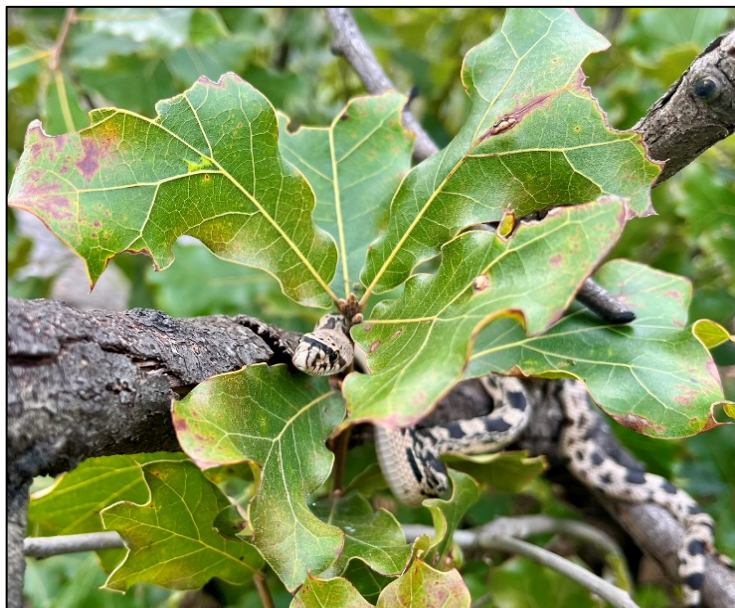
Below: A hatchling pine snake explores the environment surrounding the nesting area upon release, 1.5 weeks after hatching.