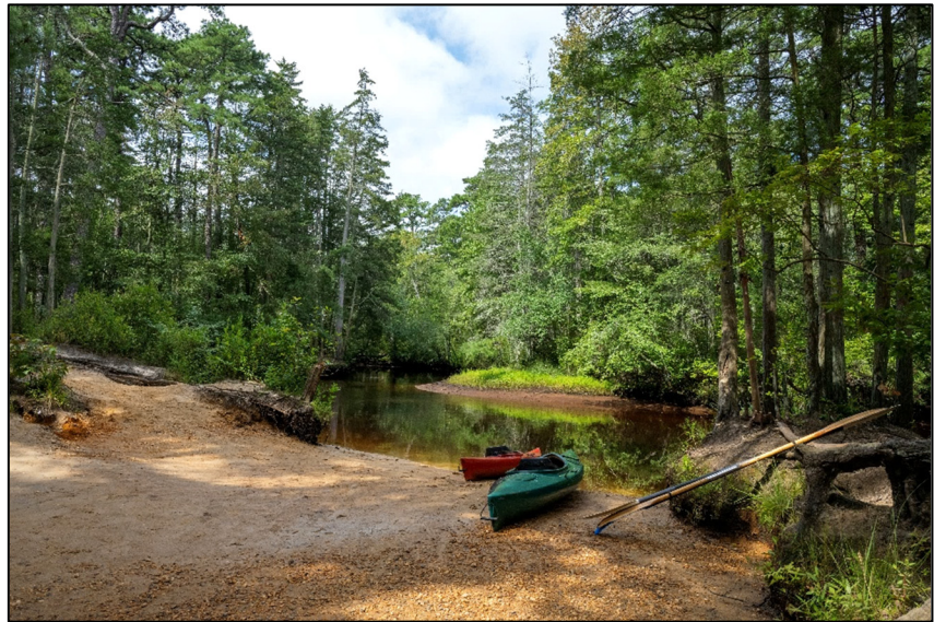
Above: The Commission shared 157 photos on Instagram in August, including this photo of kayaks on the banks of the Mullica River in Wharton State Forest.