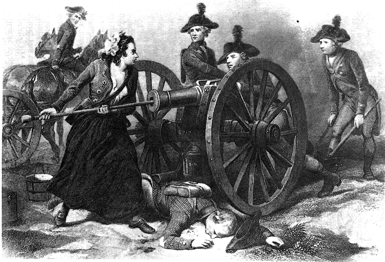
"Molly Pitcher at the Battle of Monmouth." Engraving by J. C. Armytage from a painting by Alonzo Chappel.