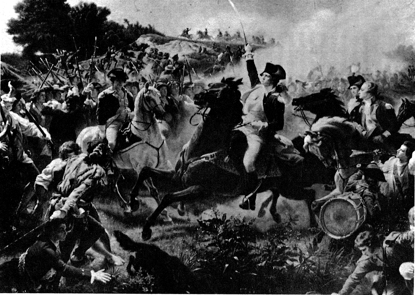
"Washington Rallying the Troops at Monmouth" (1857). Painting by Emanuel Leutze (1816-1868).