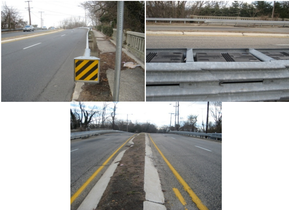
Figure 4. Photos of NJ route 71