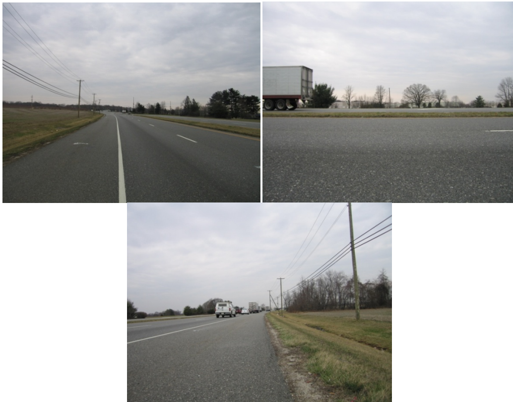
Figure 6. Photos of NJ route 322

Table 31, Table 32 and Table 33 summarize the results of naïve before-and-after analysis for road sections NJ Route 4, NJ Route 35 and NJ Route 71, respectively.