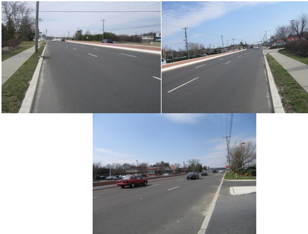
Figure 1. Photos of NJ route 30

Similarly, Figure 1 shows the photos of NJ Route 30 taken by the research team from site visits.