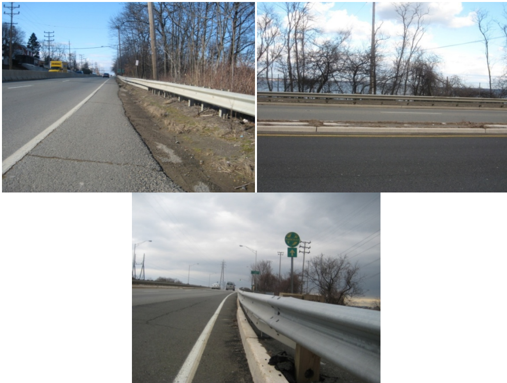
Figure 3. Photos of NJ route 35