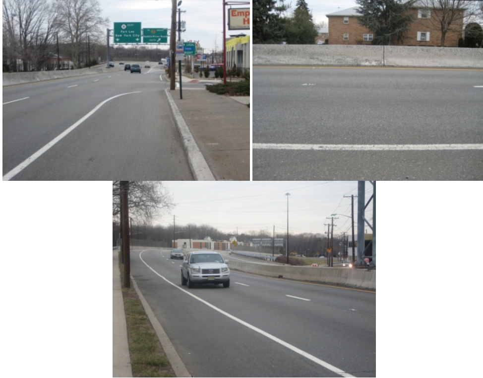
Figure 2. Photos of NJ route 4