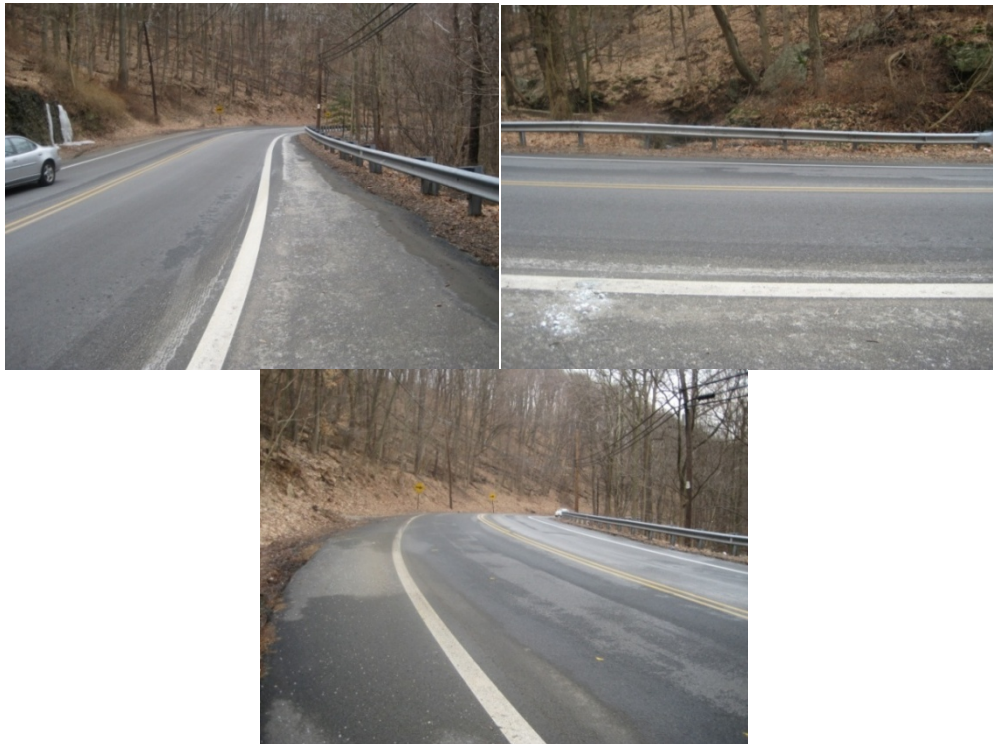
Figure 5. Photos of NJ route 517