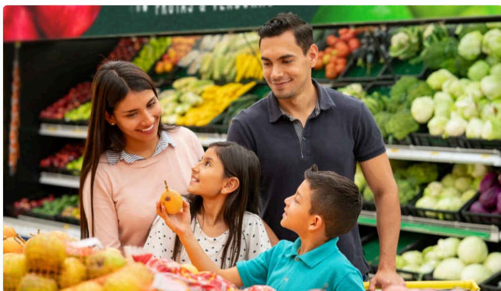
Who is Eligible?

REMINDER: Summer EBT benefits are available for four months. Summer EBT benefits expire 122 days from the date the benefits were first loaded onto your Summer EBT card. Federal regulations do not allow benefits to be replaced after they have been expunged. More information can be found in the following pages.