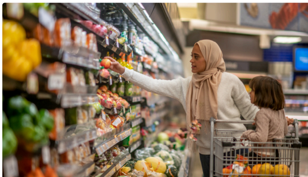
Using Summer EBT Benefits