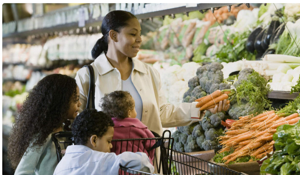
How to Apply?