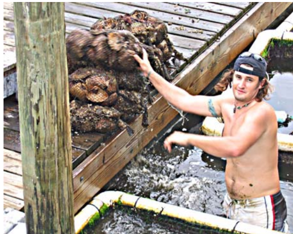
LEFT: Young oysters on clam shell substrate. RIGHT: A bayman loads bags of young oysters for a trip to the Navesink River oyster reef, where they will continue growing.