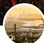
Decreased Air Quality