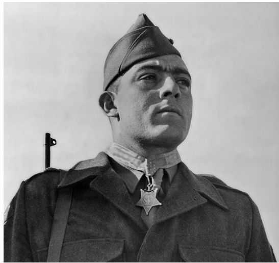
Sergeant John Basilone on the day he received his Medal of Honor.