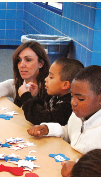
School in Vineland, with help from E. Company, 250th Brigade. Children from 31 classrooms created each one to the memory of a fallen soldier. The assignment culminated in 100 butterflies for Arlington National Cemetery.