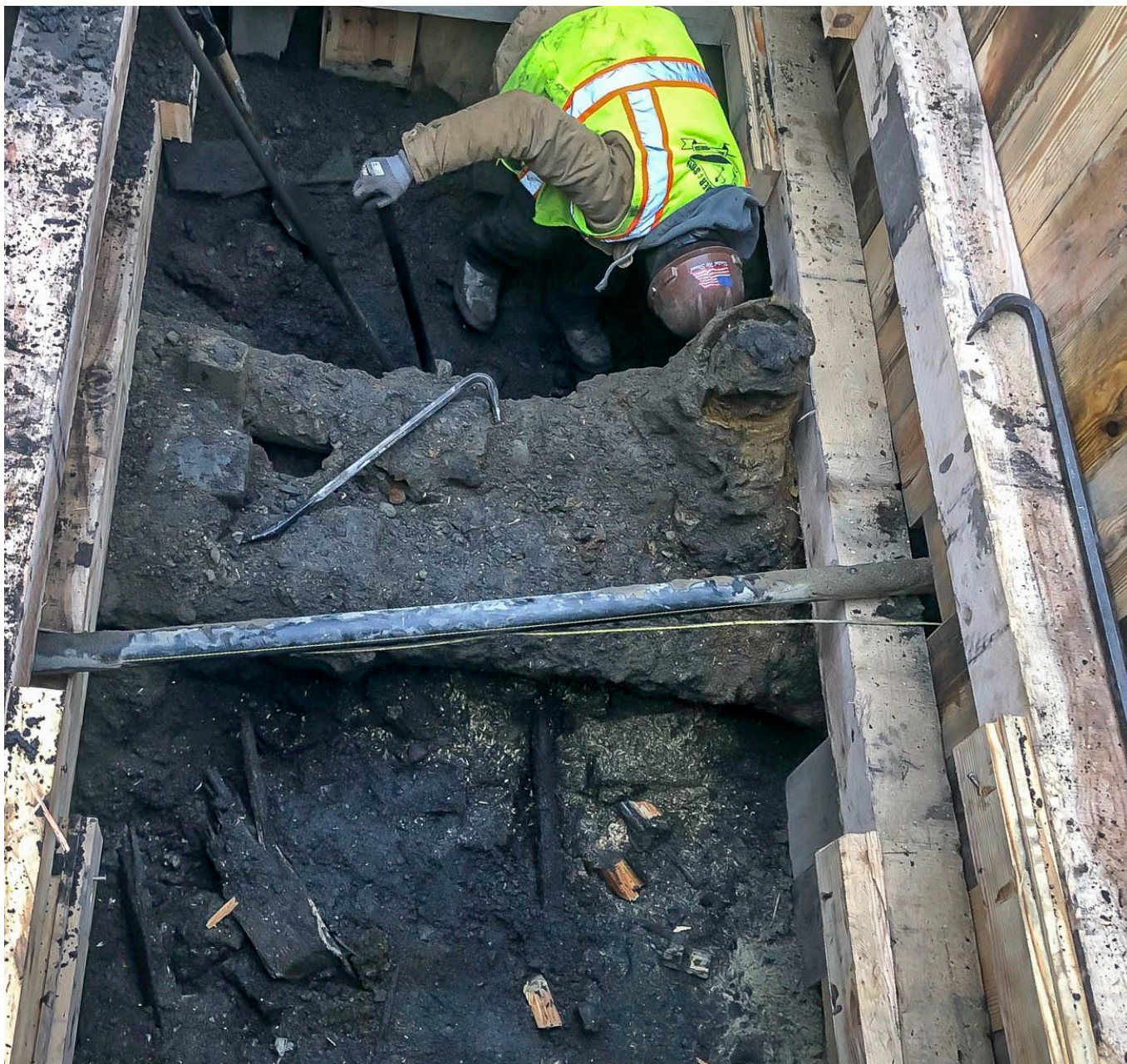
Hoboken City Water Main Upgrades. SFY2023 Financing Program.

Principal Forgiveness – In addition to the Base SFY2025 CW and DW NJEIFP financing constructs that offer loans at the Blended Interest Rate of 50% of the I-Bank’s AAA all-in market interest rate (or 75% for conduit Borrowers, and landfill projects), PF is available for certain projects (see set-aside tables below). The remaining portion of the loan will typically bear a Blended Interest Rate between 25% to 100% of the I-Bank’s AAA all-in market interest rate. Loan structures also vary based on project types.