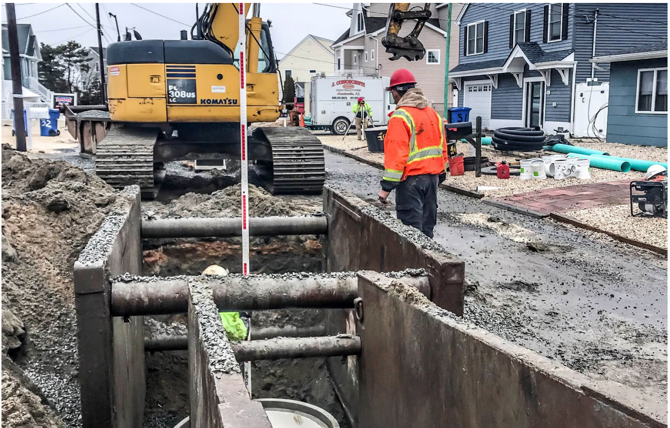
Stafford Township Sewer Rehabilitation. SFY2023 Financing Program.

A Project Sponsor may request to defer long-term financing in order to combine it with another one of its projects that is not ready for long-term conversion for cost of issuance efficiencies. If the I-Bank determines, in its sole discretion, that such deferral is warranted, a Project Sponsor may only receive one deferral and must participate in the I-Bank’s subsequent long-term financing pool, regardless of the status of the second project. In addition, Project Sponsors may receive long-term financing prior to construction completion upon I-Bank approval. In such cases, the Project Sponsor may only convert project expenses requisitioned to date and must self-finance any balance of project costs.