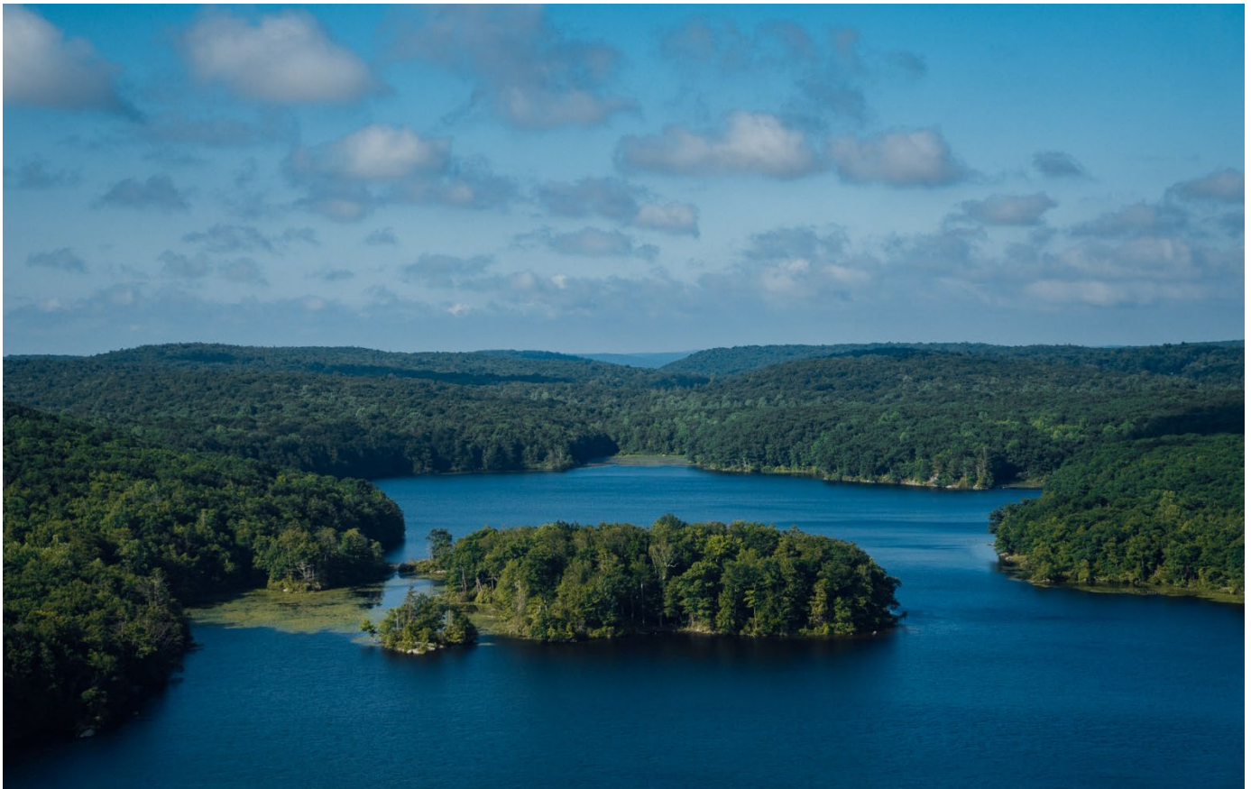
Wawayanda State Park