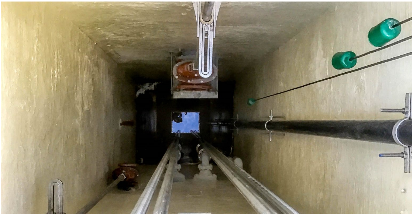
Sussex County MUA Leachate Pump Station Force Main. SFY2023 Financing Program.

Note: All projects receiving Direct Loans must have fully satisfied all Water Bank Financing Program requirements including, but not limited to, submission of all application related documents compliant with submission deadlines and receipt of all creditworthiness, project, and financial approvals. Subject to the I-Bank Board’s discretion, I-Bank Direct Loans will otherwise be capped at a total I-Bank amount of $500,000 per project.