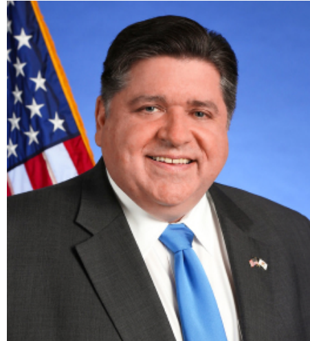
( https://usclimatealliance.org/members/illinois/ )