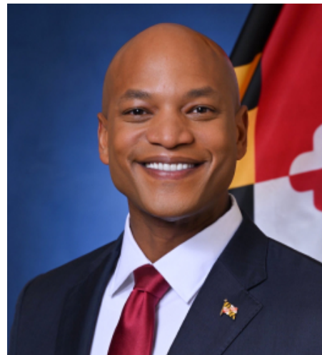
( https://usclimatealliance.org/members/maryland/ )