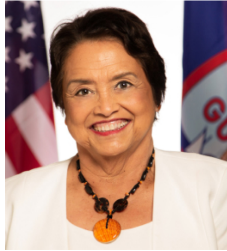
( https://usclimatealliance.org/members/guam/ )