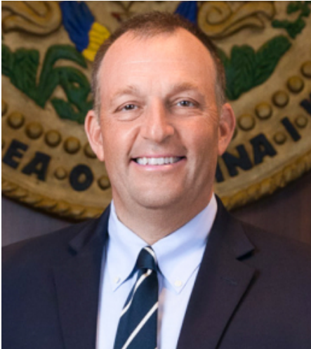
( https://usclimatealliance.org/members/hawaii/ )