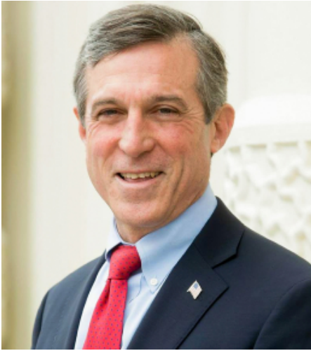
( https://usclimatealliance.org/members/delaware/ )