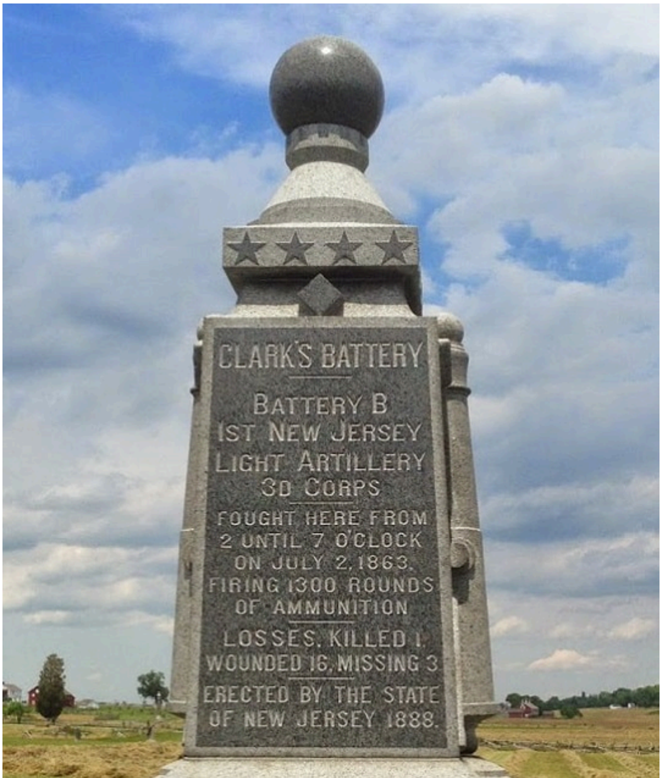
Clark's Battery Monument at Gettysburg.