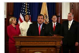
Economic Opportunity Act September 18, 2013