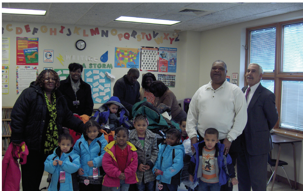
COATS — Through generous donations by DRBA employees, the DRBA's Community Initiatives Committee (CIC) collected 255 winter coats in January, which were delivered to local community agencies for distribution. In this photo, the CIC and Commissioner Lathem are shown as they delivered 50 winter coats to the Hilltop Lutheran Neighborhood Center's children and staff in Wilmington. Each year the CIC undertakes projects of ideas to help people in the river and bay region. The committee's goal for 2011 is to focus on nutrition and health of children.