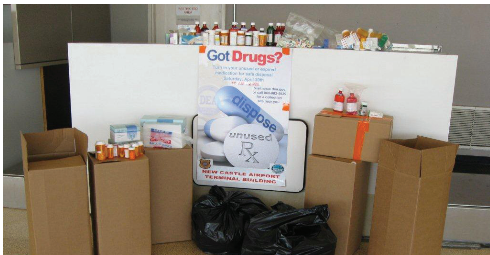
GIVE BACK - The National Prescription Drug Take Back Day at New Castle Airport Terminal was successful, as shown by this photograph. More than 250 pounds of out-of-date, unused prescriptions or over-the-counter medicines were collected for proper disposal.