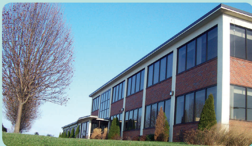
Incubating — The New Castle County Chamber of Commerce will rent this building at New Castle Airport to use for its own office as well as incubator units for start-up businesses.

The New Castle County Chamber of Commerce will lease the 27,500-square-foot-DEMA building at New Castle Airport to use as an office building and also as incubator units for start-up businesses.