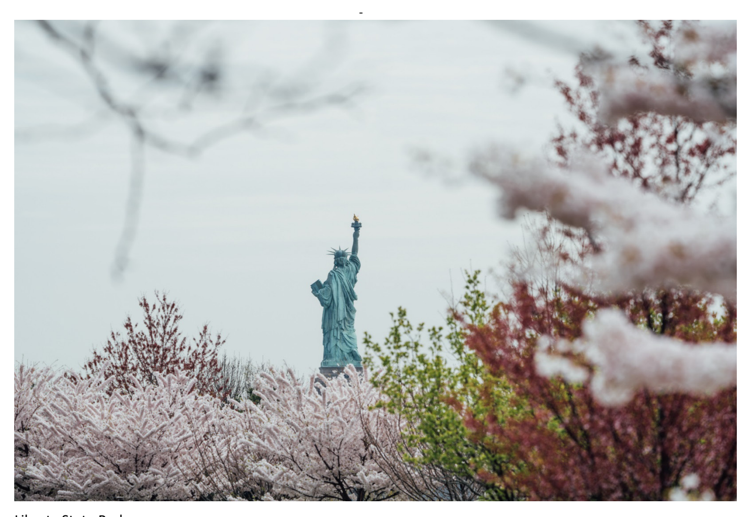
Liberty State Park