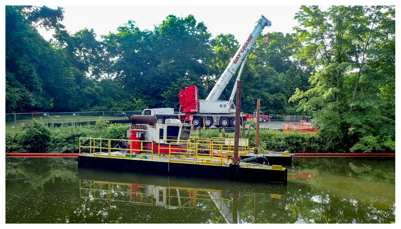
New Jersey Water Supply Authority D&R Canal Dredging. SFY2021 Financing Program.

In addition to the Base SFY2023 CW and DW NJEIFP financing constructs that offer loans at the Blended Interest Rate of 50% of the I-Bank's AAA all-in market interest rate (or 75% for investor-owned drinking water systems, Conduit Borrowers, and Landfill projects), PFLs are available for certain projects (see set-aside tables below). The remaining portion of the loan will typically bear a Blended Interest Rate between 50% to 100% of the I-Bank's AAA all-in market interest rate. Loan structures also vary based on project types.