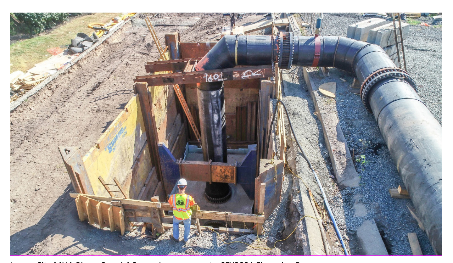
Jersey City MUA Phase 3 and 4 Sewer Improvements. SFY2021 Financing Program.

Funding in the amount of approximately $515 million is available for DW project loans in SFY2023. Of this amount, approximately 50% will be available from State funds, including prior State bond acts, federal capitalization grants, repayments of prior Fund Loans, appropriations, and interest earnings and the remaining 50% will be available from proceeds of bonds issued by the I-Bank.