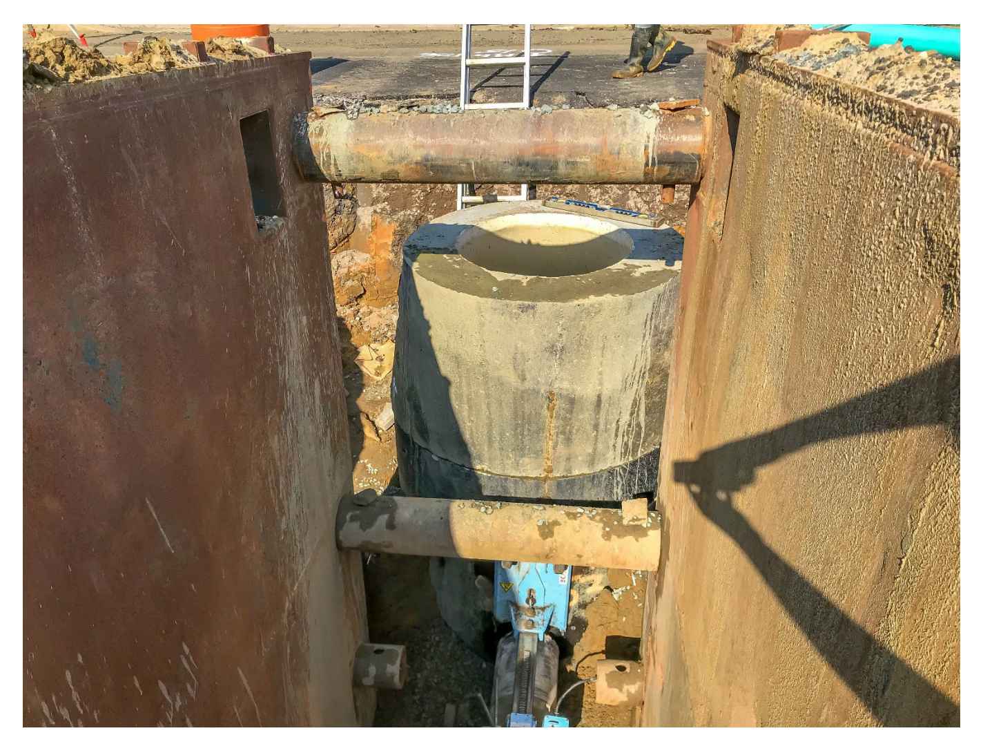
Plumsted Township Advanced Wastewater Treatment and Collection System. SFY2021 Financing Program