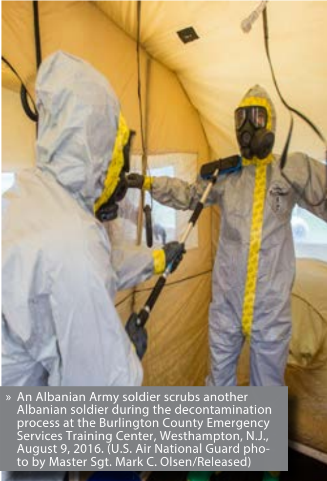
» An Albanian Army soldier scrubs another Albanian soldier during the decontamination process at the Burlington County Emergency Services Training Center, Westhampton, N.J., August 9, 2016.

The 21st Weapons of Mass Destruction Civil Support Team, New Jersey Army National Guard, held a two-day class, August 8-9, 2016, for Albanian soldiers on detecting chemical, biological, radiological, and nuclear threats, along with emergency management training at the Burlington County Emergency Services Training Center, Westhampton, N.J. The class culminated in an exercise where the Albanians were tested on what they learned. Albania has been a state partner with New Jersey since 2001. The National Guard State Partnership Program is a U.S. Department of Defense program managed by the National Guard that links U.S. States with partner countries around the world for the purpose of supporting the security cooperation objectives of the geographic Combatant Commanders.