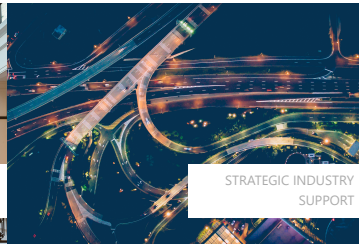
STRATEGIC INDUSTRY SUPPORT