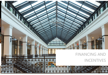
FINANCING AND INCENTIVES