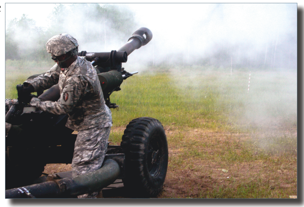
A gunner from the 3rd Battalion, 112th Field Artillery fires a 105 mm round from an M119A2 Towed Howitzer during a training exercise at Camp Grayling, Mich., from June 11 – 25. Soldiers from the New Jersey National Guard unit were able to certify their howitzer sections on the new artillery weapons.

In addition, the Soldiers are extremely excited to field the new howitzers and to be back in the artillery operations.