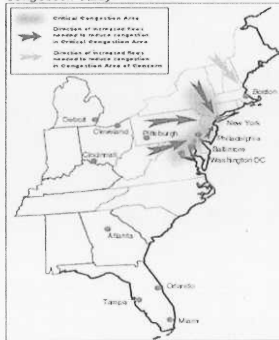
Figure 4-1. Eastern Critical Congestion Area and Congestion Area of Concern Identified in the 2006 National Electric Transmission Congestion Study

It is against this backdrop that the repowering of the B.L. England plant must be considered. Previous 2012 modeling of B.L. England’s supply of electricity to the Pinelands area prepared by PowerGEM, LLC was submitted by SJG to the Pinelands Commission, which demonstrated the clear benefits of repowering the facility to satisfy the electricity needs of southern New Jersey and the Pinelands area, especially with the loss of electric generation from the pending closure of the Oyster Creek Nuclear Generating Station in five (5) years. This modeling recently was updated by PowerGEM based upon the latest information. The evaluation indicates that the reliability need for B.L. England only has increased due to circumstances not present a year ago. PowerGEM finds that if B.L. England is not repowered, eight separate electrical circuits within the Pinelands area will experience overloaded conditions in 2019, necessitating action by the PJM to ensure grid reliability. While it is not possible to predict precisely how PJM will address these grid overloads, a probable solution is the construction of additional transmission capacity, some of which likely would be located within the Pinelands area due to its location immediately west of the heavily populated coastal region of the State.