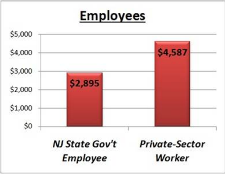
*For an average State employee earning $60,000 a year with a NJD15 family plan and a similar PPO with a private-sector employer