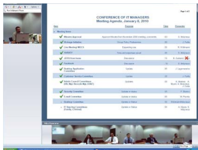
This photograph shows how the Conference of Information Technology Manager's meeting was conducted using Microsoft Live Meeting. The technology saves money and travel time

The Conference of IT Managers is establishing protocols for Live Meeting and looks forward to a statewide roll-out of the technology.