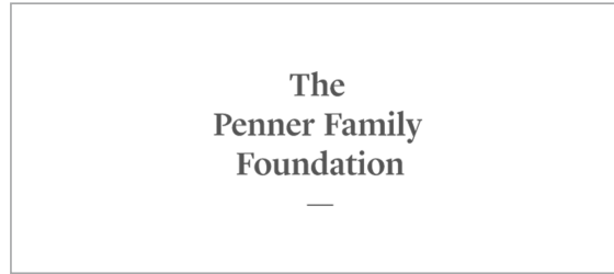
Penner Family Foundation