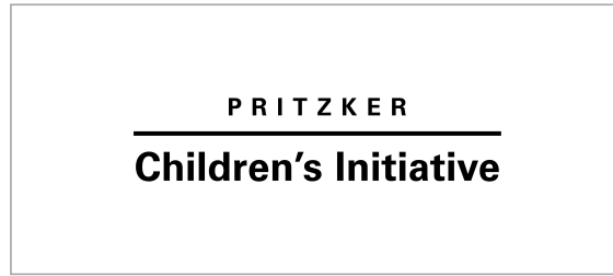
Pritzker Children's Initiative