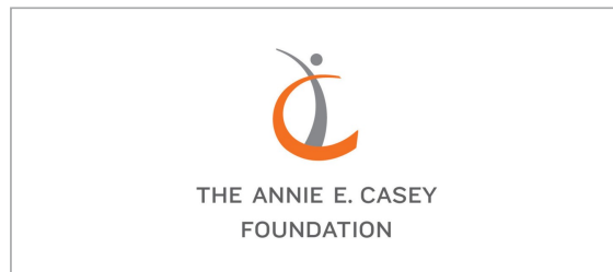
Annie E. Casey Foundation