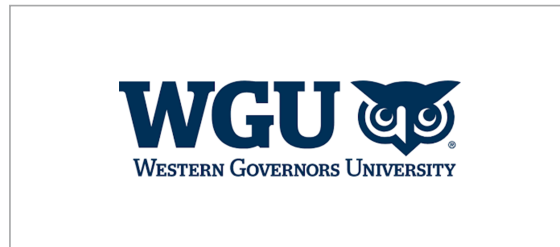
Western Governors University