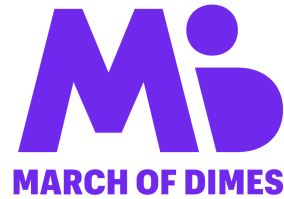
March of Dimes