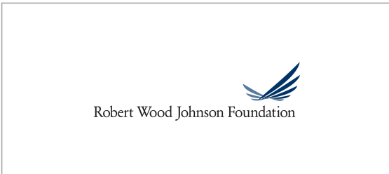
Robert Wood Johnson Foundation