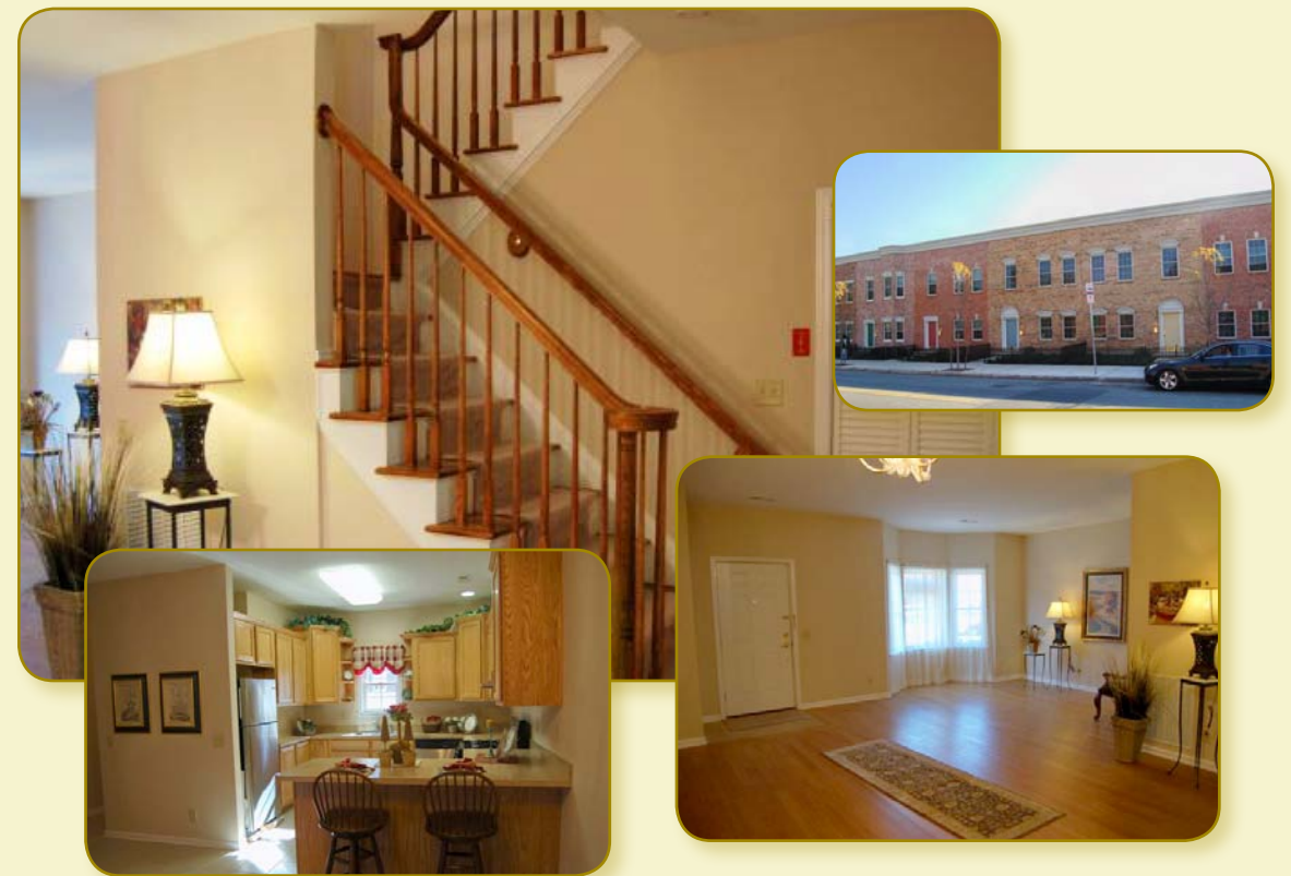
Harriet Tubman Homes was developed with the assistance of HMFA's CHOICE Program