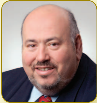
JOSEPH V. DORIA, JR. COMMISSIONER DEPARTMENT OF COMMUNITY AFFAIRS