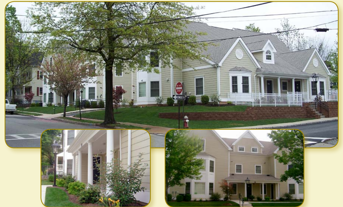
Abbett Avenue Apartments was developed with the assistance of HMFA's Special Needs Housing Trust Fund

Much thought went into the project's design in order to foster a greater sense of community through the scale of the buildings, consistency with the existing residential character, and layout. In addition, Morristown, an approved Transit Village, offers the residents of Abbett Avenue Apartments a vibrant downtown shopping area, multiple employment opportunities, and easy access to extensive public transportation.