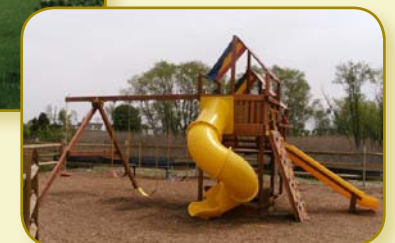
Sharp Road Family Housing was developed with the assistance of HMFA's Multifamily Housing Bonds and the Federal Low Income Housing Tax Credit Program