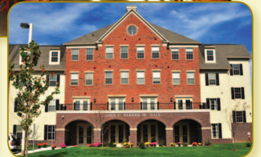
John O. Parker, Jr. Hall was developed with the assistance of HMFA's Federal Low Income Housing Tax Credit Program