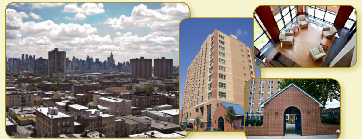
Kennedy Towers (shown above) was developed with the assistance of HMFA's Federal Low Income Housing Tax Credit Program

There was a real learning curve in producing the affordable housing. I had to learn how to manage multiple sources of financing, as well as pulling together all of the information that is needed to apply for tax credits. The process is a real public/private partnership wherein you need the local government, the county, the state and federal government, as well as a tax credit investor. I am very proud that we were successful in obtaining the tax credits and opening our 70-unit senior building for which 20% of the units are occupied by the frail/elderly, which is a niche really needed in our community.