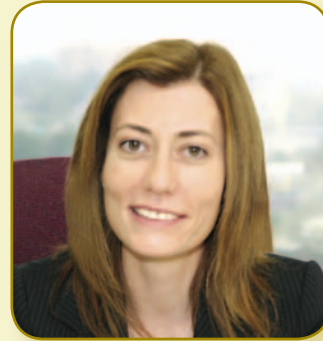
ANNE MILGRAM ATTORNEY GENERAL