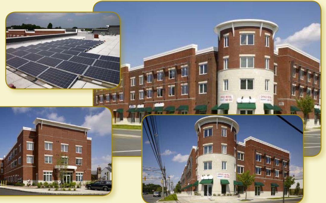
Heritage Village at Lawrence was developed with the assistance of HMFA's Special Needs Housing Trust Fund and the Federal low Income Housing Tax Credit Program