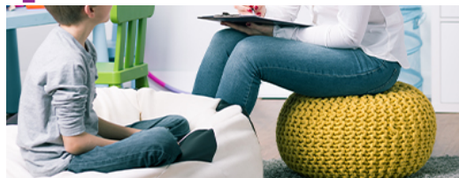
Individual Therapy Services