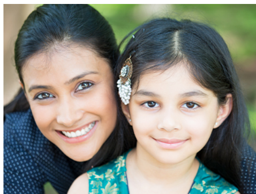
Parent/Caregiver Support Groups