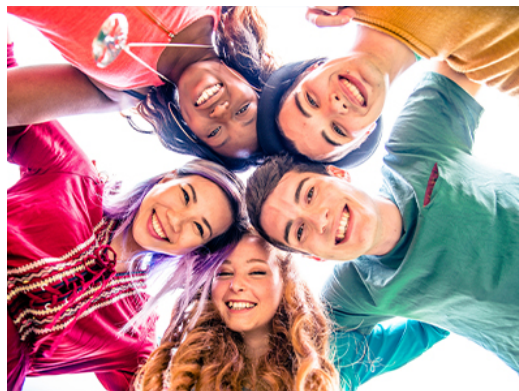
LGBTQ+ Youth & Young Adult Support Groups