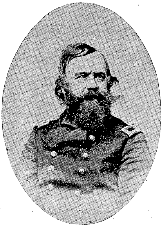
MAJ. GEN. ALPHEUS S. WILLIAMS.