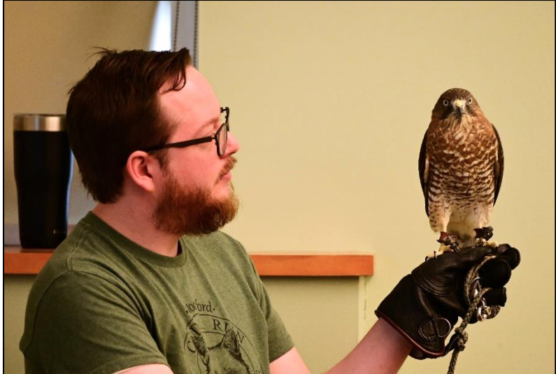
Above: Educators from the Woodford Cedar Run Wildlife Refuge delivered a presentation on the Raptors of the Pinelands during the 36 th annual Pinelands Short Course on March 8, 2025.