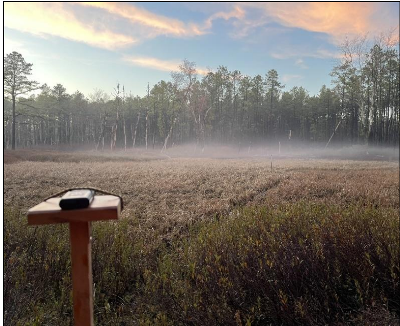
Above: This sedge dominated site is one of 22 ponds where frog and toad vocalization surveys are conducted. A digital recorder mounted on a post is readied to record vocalizations after sundown.