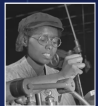
A lathe operator at an aircraft manufacturing plant in Milwaukee, Wisconsin, 1942.

The image of Rosie the Riveter was heavily used during WWII to promote the enlisting of women into the workforce. Although the message was clear and resulted in a mass growth in women workers, the poster is often seen as a reminder of the history regarding one specific group of women and overshadowing the minority. The 'Black Rosies' were a group of African American women who played a big role in the workforce during WWII with their involvement in factories, shipyards, and offices. Since it was harder for black and Latina women to obtain said positions compared to white women, President Roosevelt took this into consideration and signed the Executive Order 8802 which put a stop to discrimination of race within defense jobs. This EO gave black women new opportunities to learn trades and excel in work like welding and metalwork. WWII provided these ladies a chance to make a decent wage and help our nation's freedom, even when civil rights were not extended to them yet.