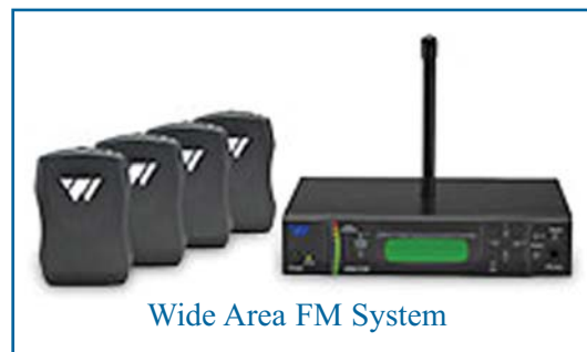
Wide Area FM System

FM Systems can be used most any where including, classrooms, at work, meetings, restaurants, family dinners, in the car, on a plane or trains, for