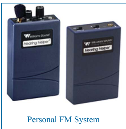
Personal FM System

Assistive Listening Devices (ALD) are amplification systems designed specifically to help people with hearing loss hear in a variety of difficult listening situations. ALD's can be connected to a personal hearing aid, cochlear implant (CI) or used with headphones, ear buds, or neckloop, to help overcome background noise and distance from the sound source.