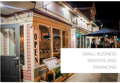
SMALL BUSINESS SERVICES AND FINANCING