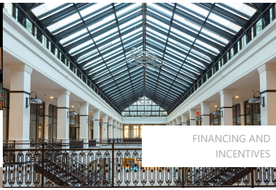
FINANCING AND INCENTIVES