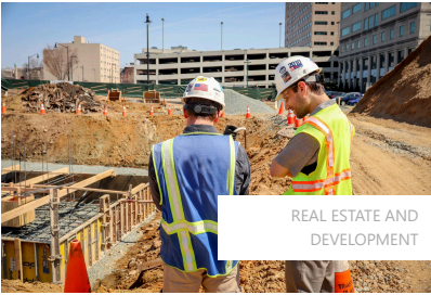
REAL ESTATE AND DEVELOPMENT