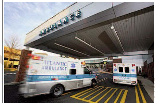
Overlook Medical Center

Proceeds from this sale were used to refund AHS's outstanding 1997 Newton Bonds and provide for the acquisition of capital budget items including the ER & parking garage at Morristown and neuroscience services at Overlook, as well as acquisition and installation of equipment at their three campuses.