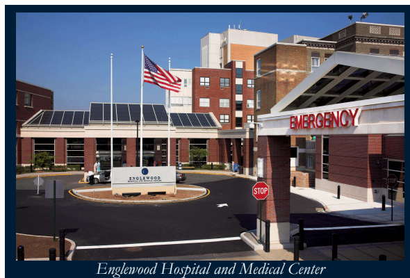
Englewood Hospital and Medical Center

In February of 2011, Englewood Hospital and Medical Center received