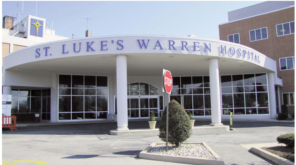
St. Luke's Warren Hospital

St. Luke's Warren Hospital is a 214-bed, not-for-profit general acute care hospital located in Phillipsburg. §