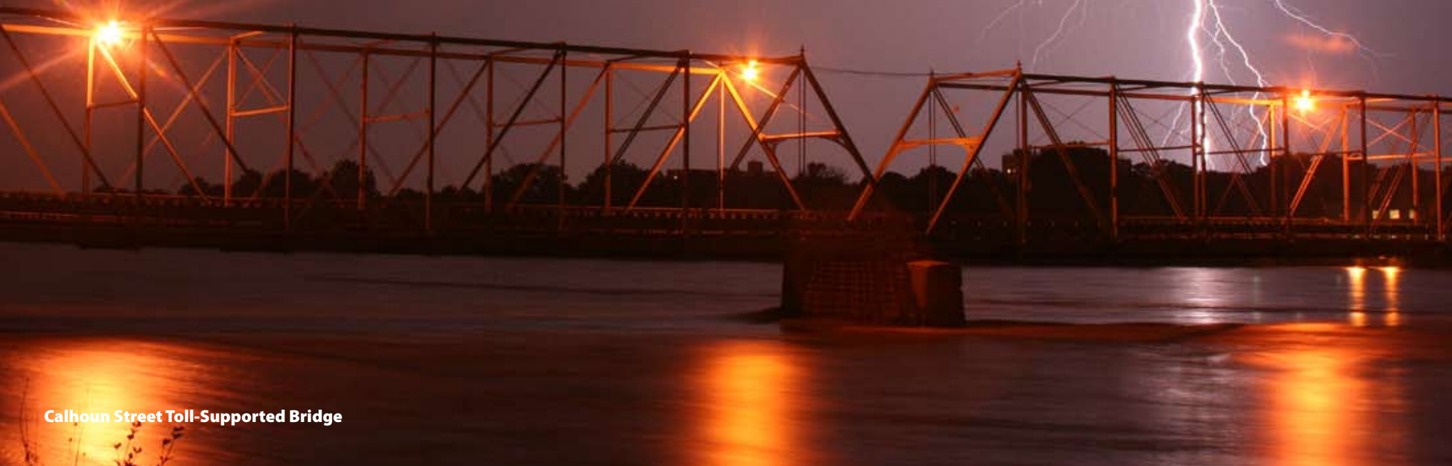
Calhoun Street Toll-Supported Bridge