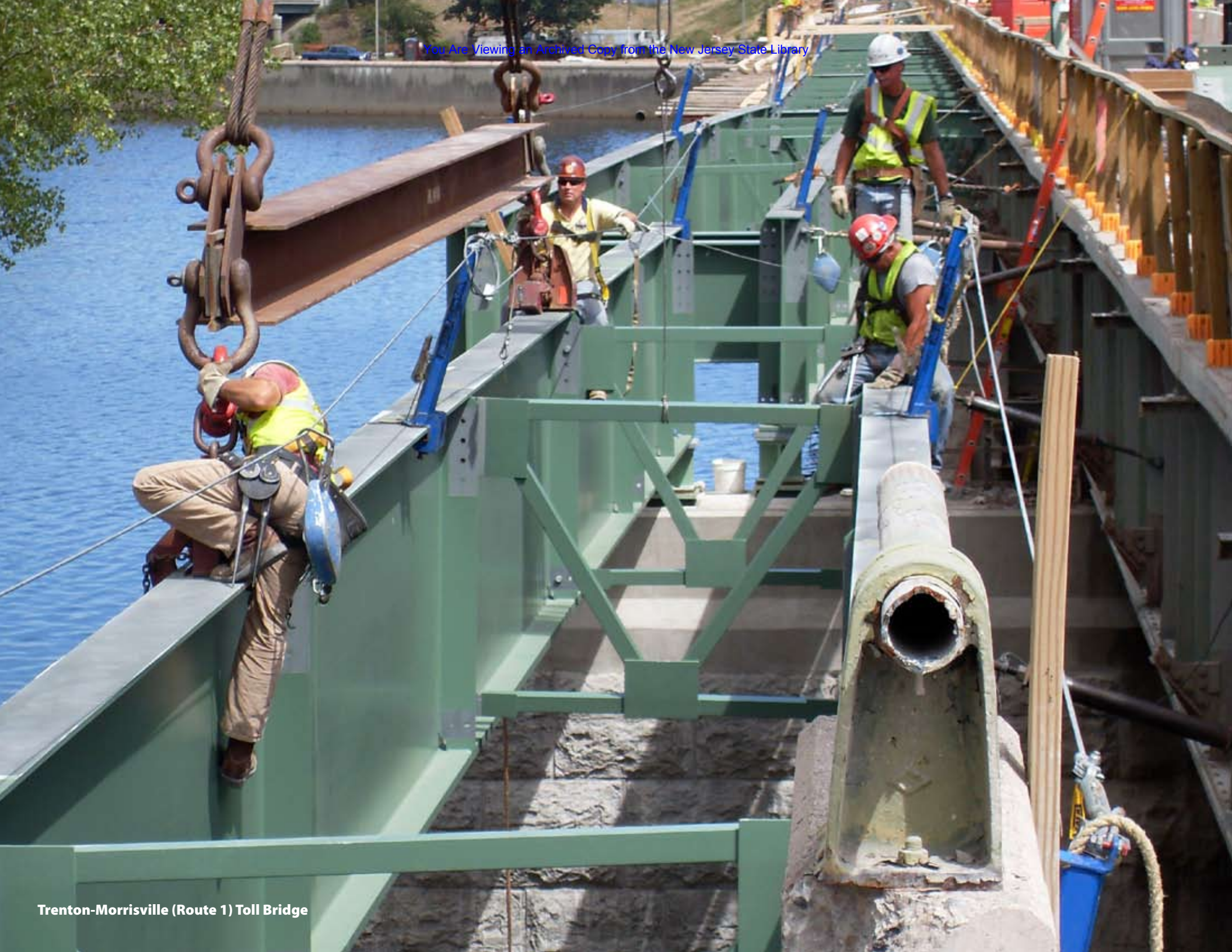
Trenton-Morrisville (Route 1) Toll Bridge