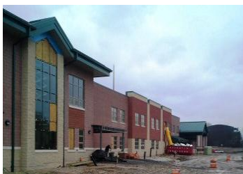
Catrambone Elementary School - Long Branch