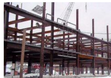
Henry Street Elementary School - Passaic City