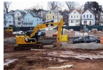
Elliott Street Elementary School - Newark