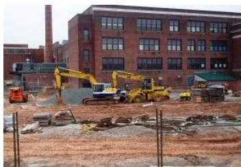
Academic High School - Elizabeth

Since a picture is worth a thousand words, the SDA has striven to keep community members updated on project progress through the posting of monthly progress photos for active construction projects. Progress photos can be accessed on the SDA's website at: http://www.njsda.gov/Schools/Project_Progress_Photos.html . Below is a sampling of progress photos from the reporting period.