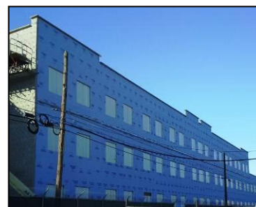
Construction progress of Redshaw Elementary School in New Brunswick during the reporting period.

This reporting period is highlighted by a substantial amount of activity on the SDA's Capital Portfolio Projects. In fact, more than half of the 39 projects in the portfolio were in construction/design by the end of the reporting period, including nine schools currently in active construction. These nine schools will provide 8,300 new seats for students in eight school districts. These projects represent more than $561.5 million in total estimated project costs and make available vital opportunities for New Jersey's construction industry.