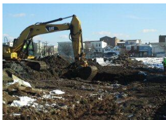
Oliver Street Elementary School - Newark