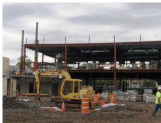
Redshaw Elementary School - New Brunswick