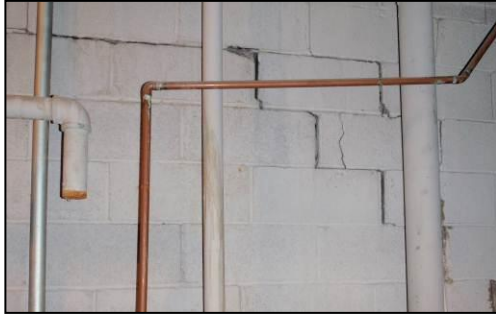
Cracked loadbearing wall that was fixed through an emergent project

Often, emergent projects require significant design work, due to the need for asbestos abatement or other considerations. This sometimes requires that a project have predesign services. Predesign allows for the design consultant to identify the true source of the conditions. A problem may be identifiable by sight, but a determination must still be made as to what is causing the problem so that the remedy selected is the