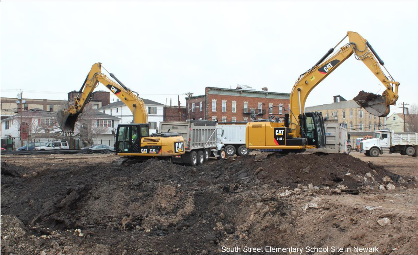
South Street Elementary School Site in Newark